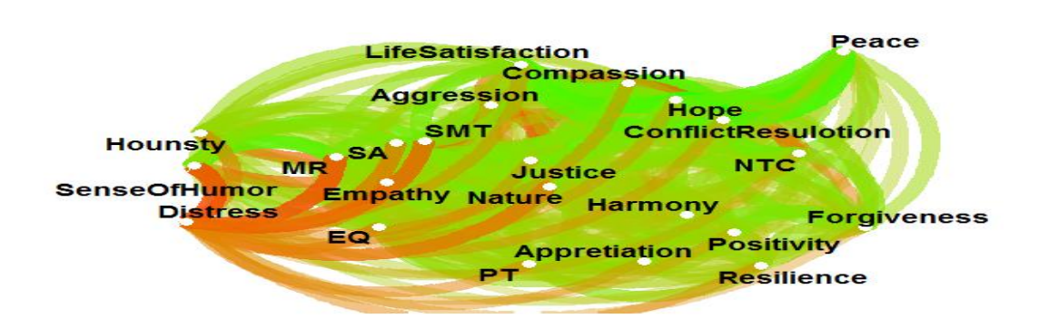
Fig 1. Correlation between peace-related variables